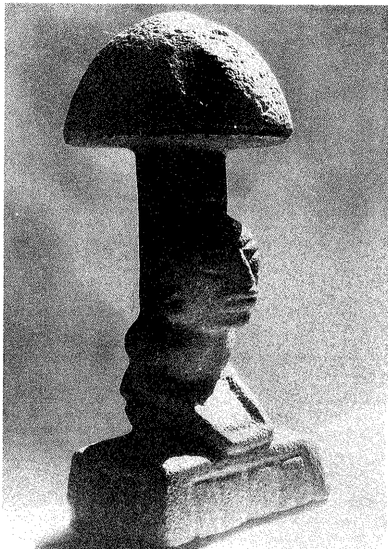
Fig. 1 - Mushroom Stone.

his famous historical work, Historia General de las Cosas de Nueva España , written between the years 1529 and 1590. These mushrooms, which were called in the Aztec language «Teonanacatl», what means «God's Flesh», played an important part in the pre-Columbian cultures of Central America. To the Christian missionaries, the inebriating, vision- and hallucinations-producing effects of these mushrooms seemed to be Devil's work. They therefore tried by all the means of their power to extirpate their use. But they succeeded only partially, for the