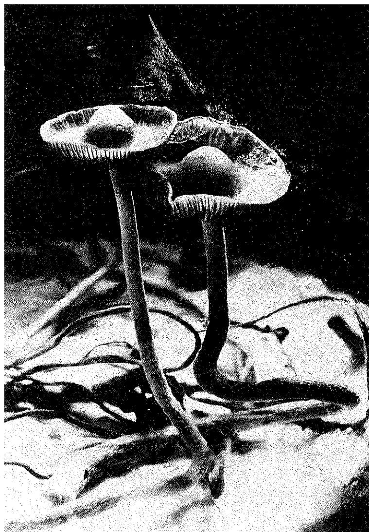
Fig. 2 - Psilocybe mexicana Heim.

to undergo a strange transformation. Everything assumed a Mexican character. As I supposed that my knowledge of the Mexican origin of the mushrooms would lead me to imagine only Mexican scenery, I tried consciously to look at my environment as I knew it normally. But all voluntary efforts to look at things in their customary forms and colors proved ineffective. Whether my eyes were closed or open I saw only Mexican motifs. When the doctor supervising